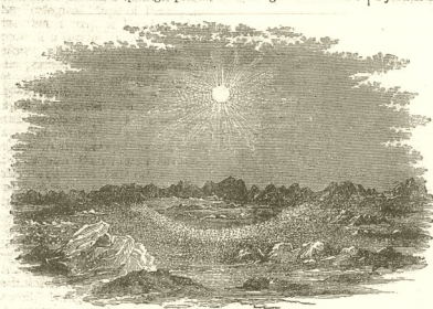
FIG. 2.—Diamond Dust.

exhibited on p. 300 of vol. i. (see Fig. 2), which will give the reader some idea as to how snow-blindness may be produced, and which might have reminded Capt. Nares that the expedition was provided with the instrument we speak of. When the sun reaches a certain height, above 14^{\circ} , during clear weather, "the most brilliant prismatic colours are displayed by each minute snow-prism, and in combination form a sparkling arc on the snow-covered ground, the bright light from which is too powerful for the unprotected eye. The 'diamond-dust,' as we term it, becomes more open as the length of the radius is increased. Consequently, when the sun is between fourteen and twenty-three degrees in altitude, the refraction of its rays is set forth with the greatest effect, and snow-blindness has to be guarded against. In the bright arc, while each tiny prism displays its complete set of colours, the red tint is the most prominent nearest the sun, the purple lying on the outside indistinctly defined." We regret that such observations were so rare, and that so little use was made by the expedition under Capt. Nares of the fine set of apparatus for physical observations with which it was provided. This is the weak point of the expedition, and, so far as physical science is concerned, the "Arctic Manual" need hardly have been written. The 26th paragraph of the sailing orders runs :